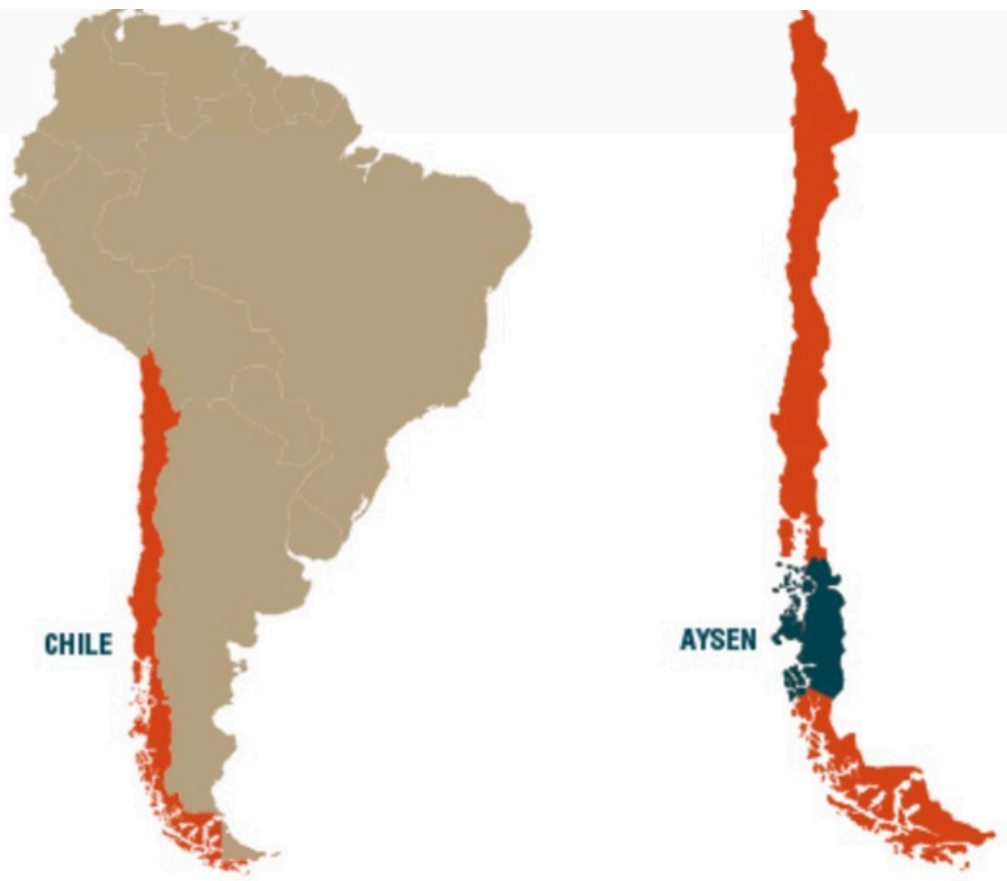
Aysén Region, Chilean Patagonia