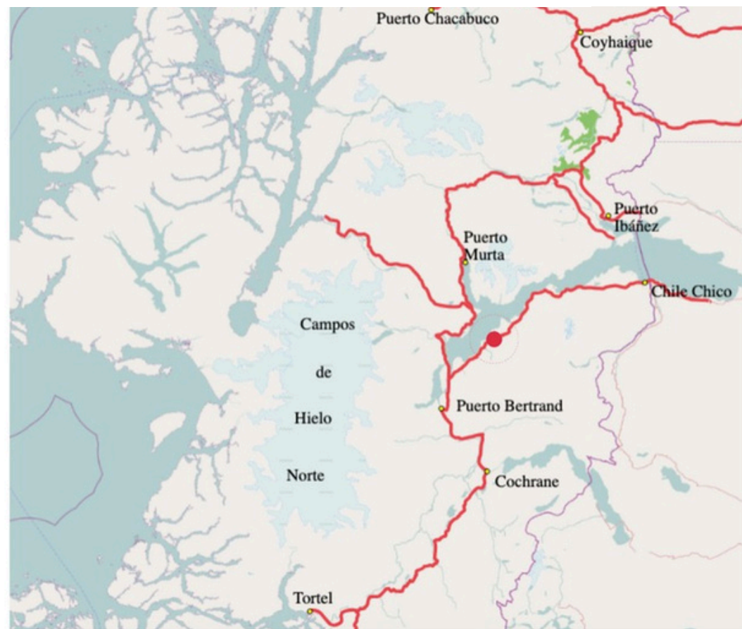
Located between Northern Patagonia icefields and Patagonia national park