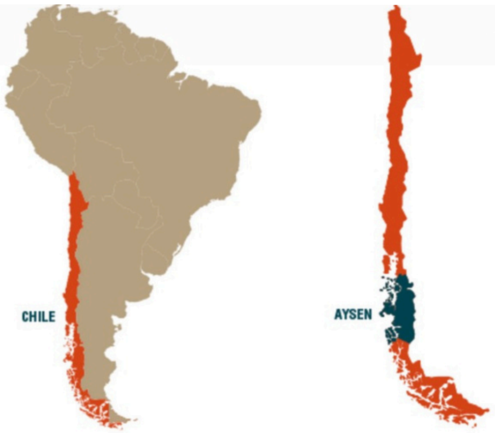
Aysén Region, Chilean Patagonia